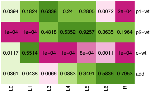
(b) Adjusted p-value