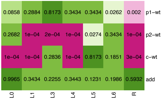
(b) Adjusted p-value