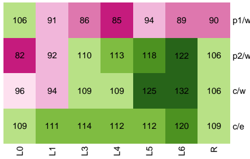
(a) Least Square Means Area