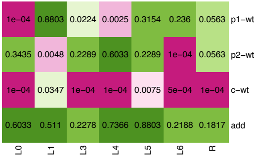
(b) Adjusted p-value