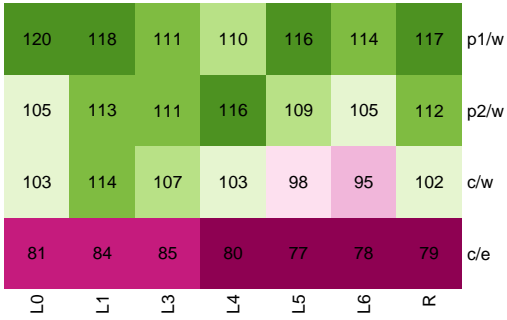
(a) Least Square Means Area