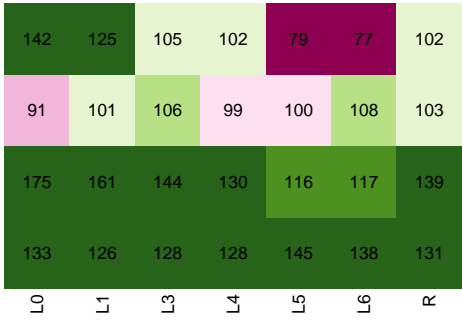
(a) Least Square Means Area