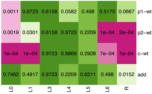
(b) Adjusted p-value