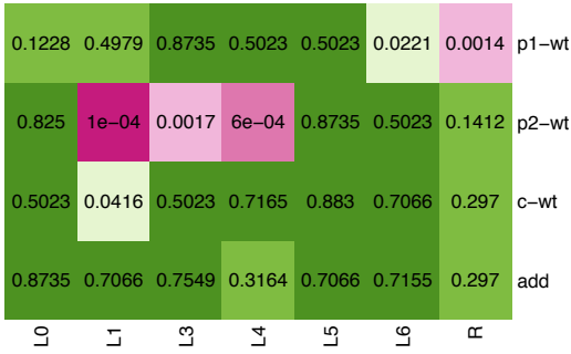
(b) Adjusted p-value