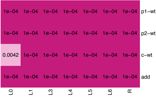
(b) Adjusted p-value