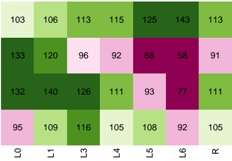
(a) Least Square Means Area