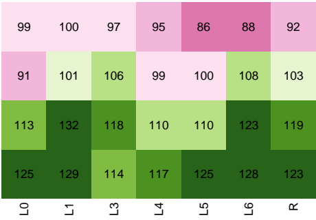
(a) Least Square Means Area