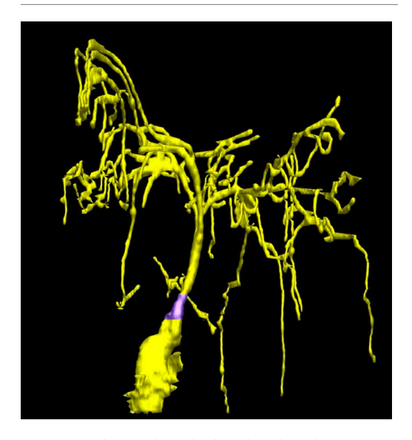
Figure 1 . Taking a closer look at the ciliated-neurons in the head of C. elegans . Doroquez, Berciu et al. provide a remarkable view of elaborate sensory neurons, such as the complex branched ciliated-endings of the so-called 'amphid wing' neurons (yellow) that are required for detecting chemicals in the environment. These tree-like branches contain molecular filaments (called microtubules) that are arranged in a variety of different ways that had not previously been recognized. It is thought that these branches increase the surface area of the cilium, allowing the animal to better sample its chemical environment. The base of the cilium is called the transition zone (purple).

Cilia are supported from within by a molecular scaffold that is made of hollow filaments called microtubules. Previous studies revealed the presence of 'electron-dense material', largely proteins, inside the microtubules of the long