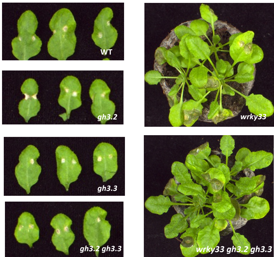
Figure 8 - figure supplement 3