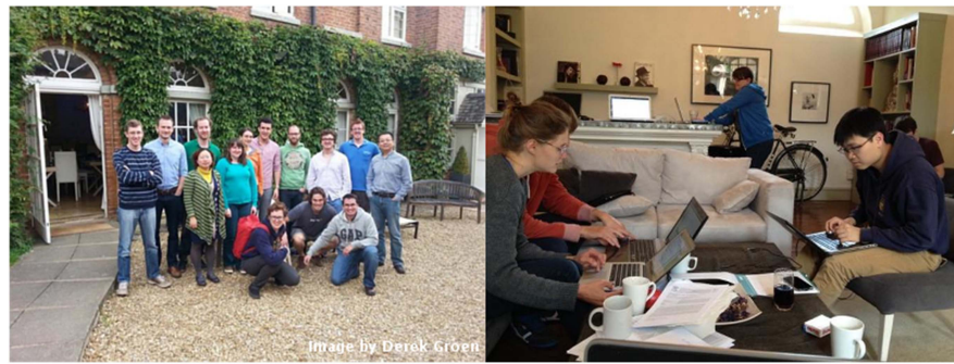
Figure 2. Left: Group photo of a subset of participants (since several of them were still working on their projects). Right: A project group working during the event.

facilities for relaxation (in our case there was an indoor swimming pool at the venue). We kept the event very informal and deliberately chose not to introduce any element of competition, so that everyone could focus on their own work, rather than worrying about what the other groups were doing.