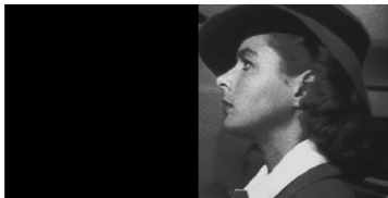
population 2 (ADLI at int. rates)