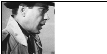
population 1 (ADLI at low rates)