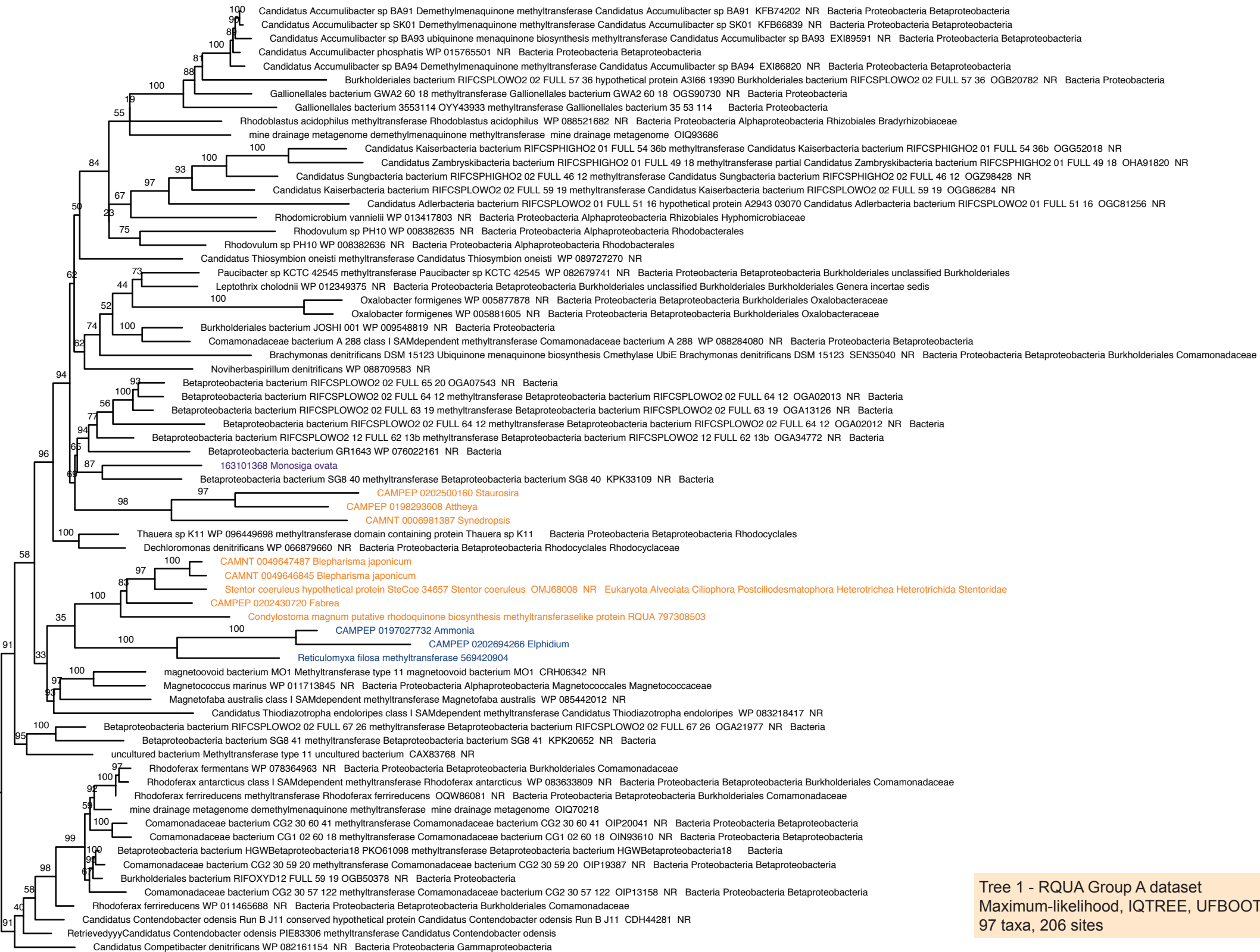
Tree 1 - RQUA Group A dataset Maximum-likelihood, IQTREE, UFBOOT - LG+C60 97 taxa, 206 sites