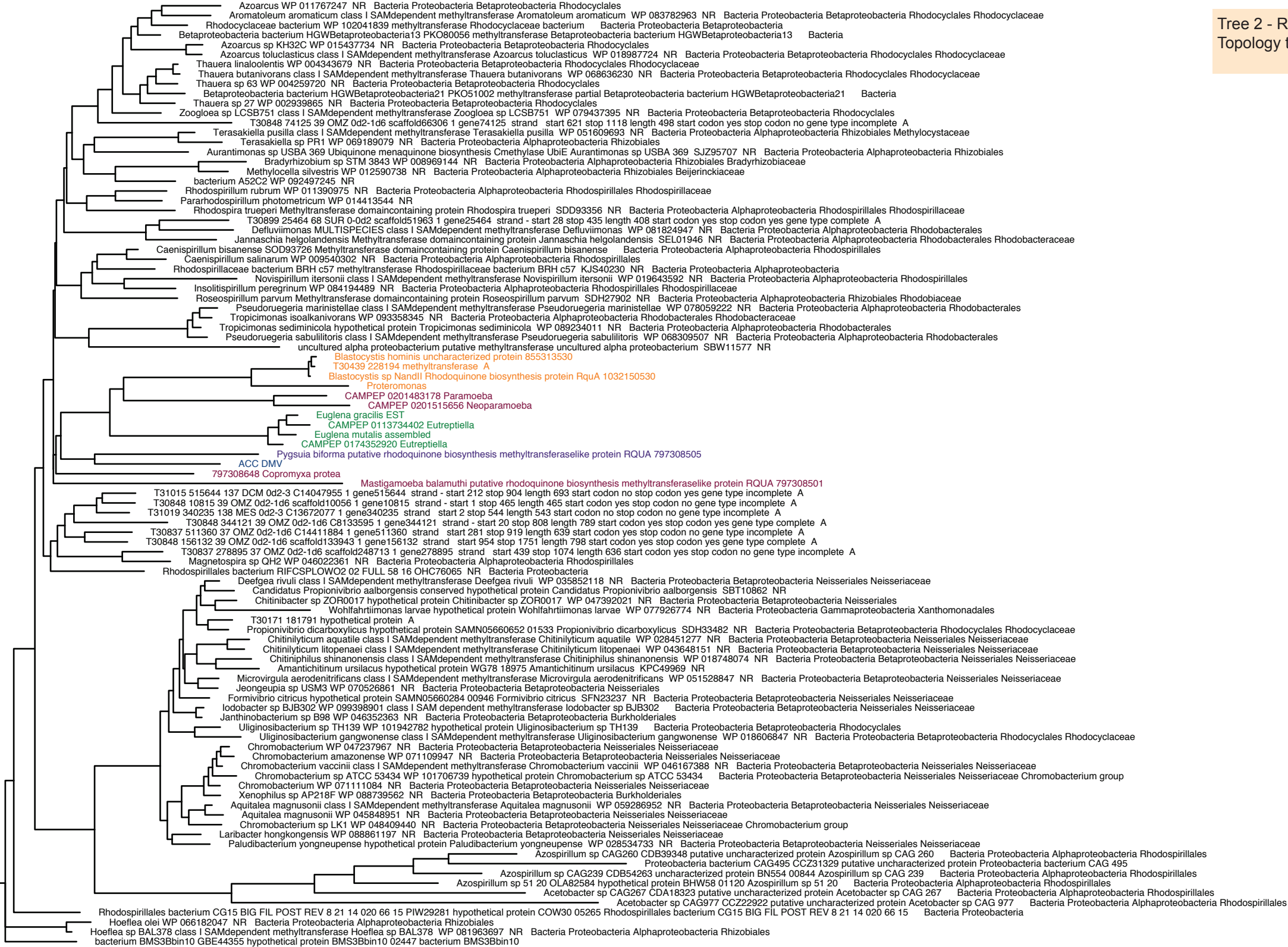
Tree 2 - RQUA Group A dataset Topology test: eukaryote monophyly