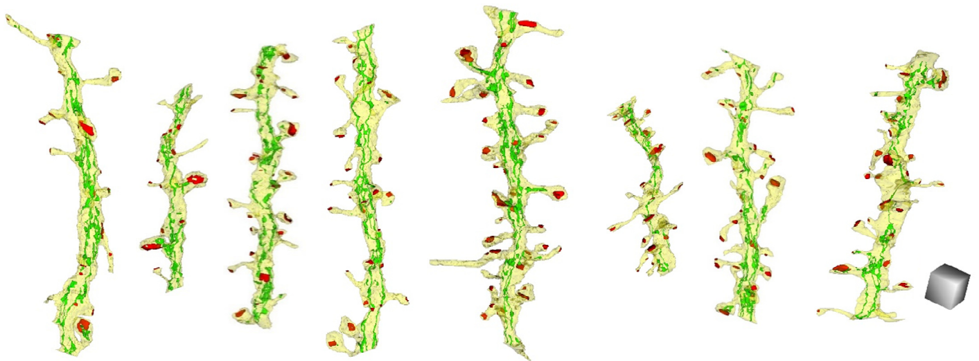
Figure 2 – figure supplement 1