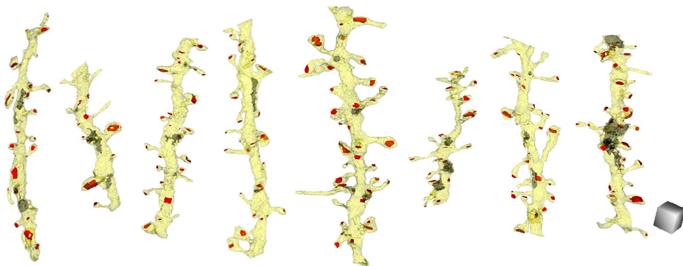
Figure 5 – figure supplement 2