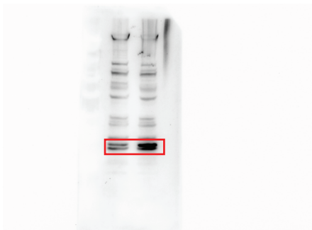
Figure 1c 20Sa7