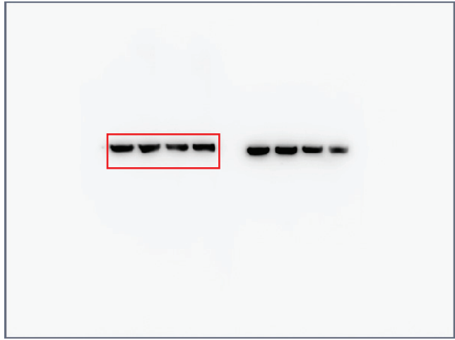
Figure 1a b-actin