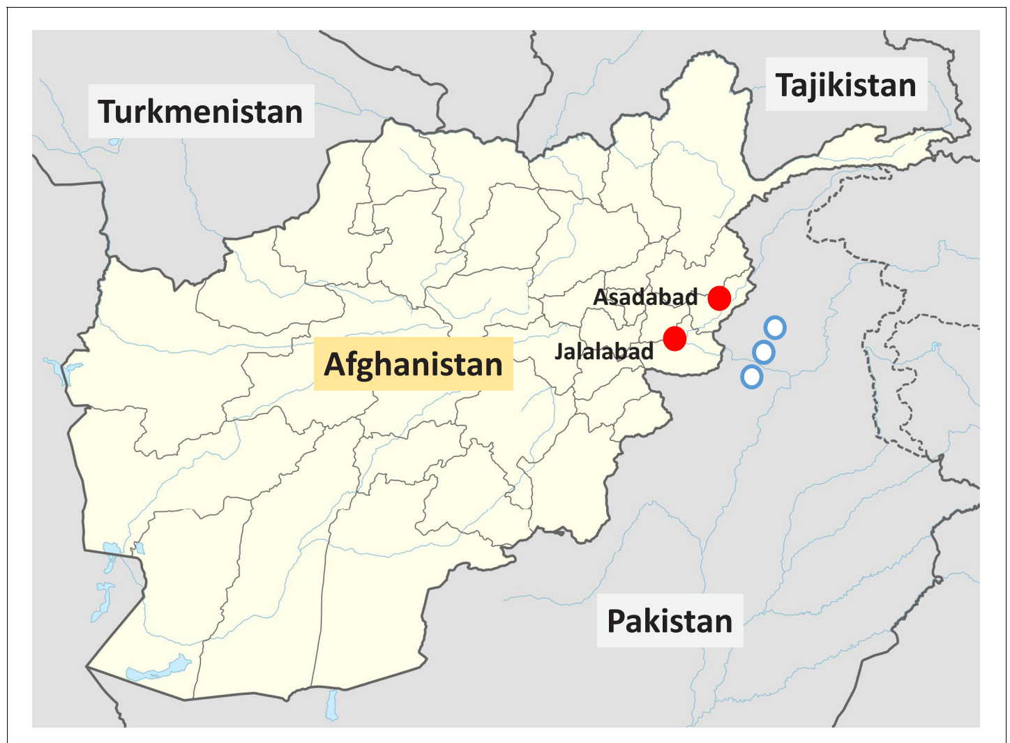
Figure 1. Locations of the two vivax malaria clinical study sites in Eastern Afghanistan from the present study (red circles), and the approximate locations of the villages in the North-West frontier province of Pakistan where Afghan Pashtun refugees were enrolled in vivax malaria clinical trials and later included in case–control studies ( Leslie et al., 2010 ) (blue circles).

vivax malaria, 7.0% (32 of 460) (RR 0.61 [0.39–0.95]) and 0.7% (3 of 460) were heterozygotes and homozygotes, respectively. Under the Bayesian model, assuming Hardy–Weinberg equilibrium,