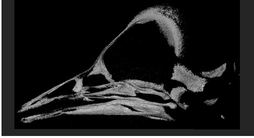
control (empty vector)