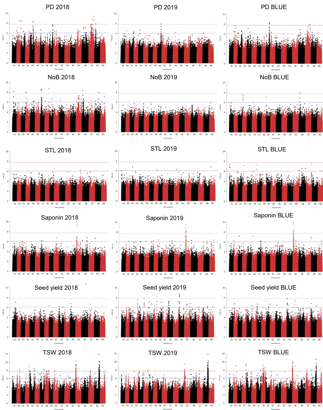
Figure 3-figure supplement 5: cont.