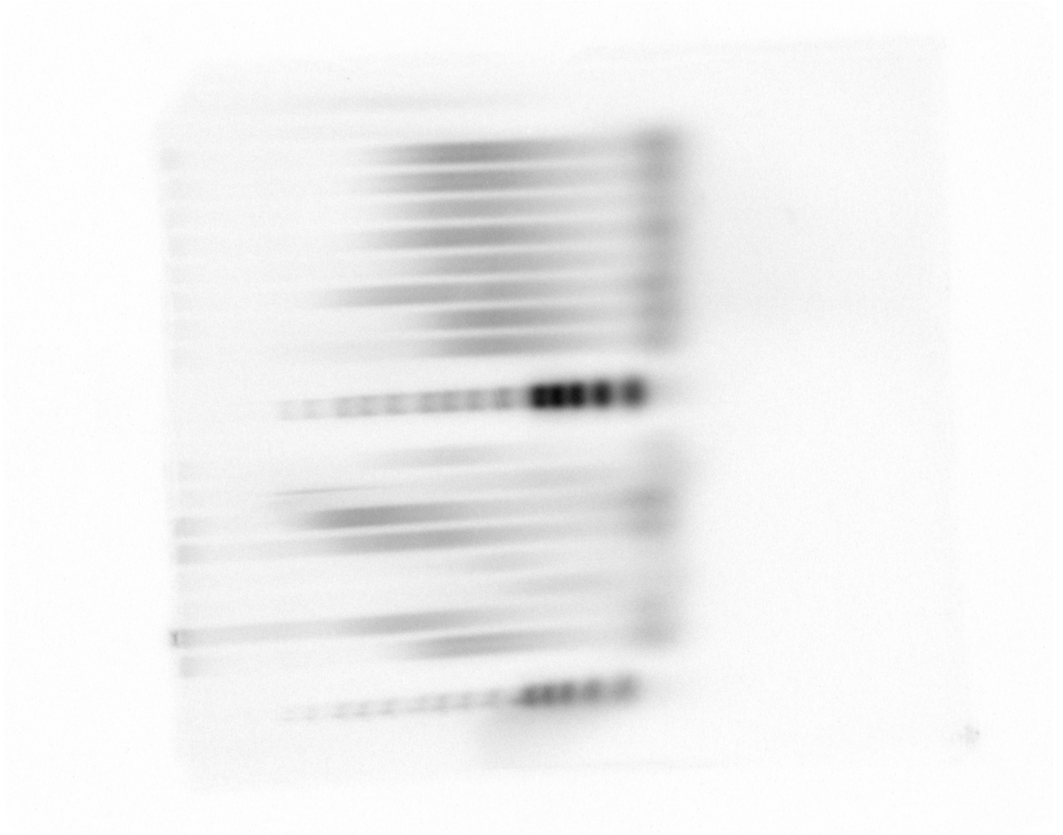
Figure 4 - source data 1.pdf 5000 x 4000