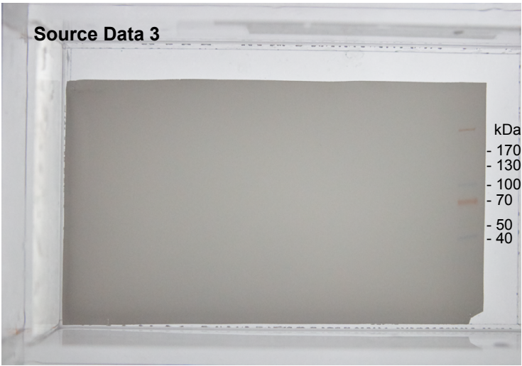
Source Data 3