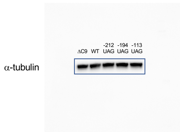
Figure 5B, NSC34 cells