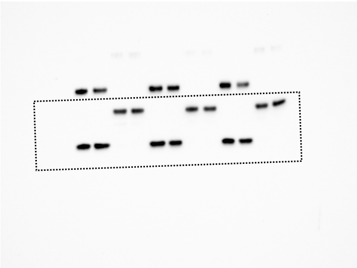
D Lower sub-panel