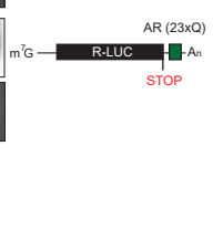
B Ribosome stalling reporter AR mRNA