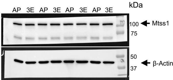
Supplementary Figure 11 – source data 1 (panel C)